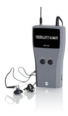
PRO-SL8 with earphones