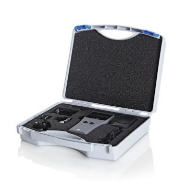
Protective Carry case