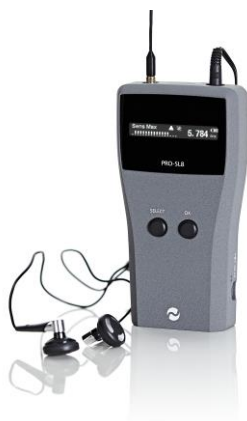
PRO-SL8 with earphones