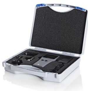
Protective Carry case